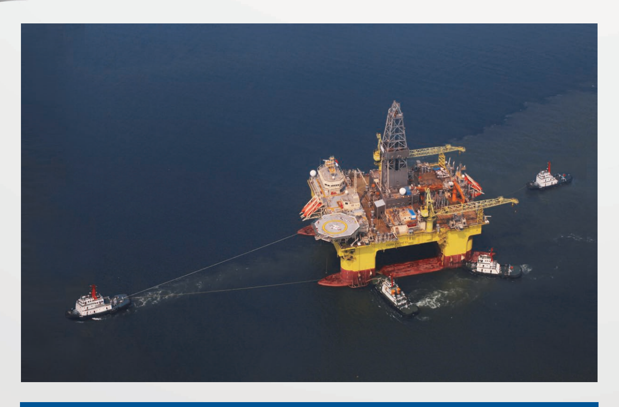
CIMC Offshore Undertakes the State's Tasks and Realizes Industrial Promotion

With the rise in offshore engineering sector, CIMC has extended its reach into the front end of offshore engineering equipment design and manufacture, and outperformed its domestic competitors. In particular, after it completed the successful delivery of 5 semi-submersible platforms in 2014, the Group received more orders. With development and announcement of the State's maritime strategy, CIMC receives great attention from the State's capital and industrial capital.